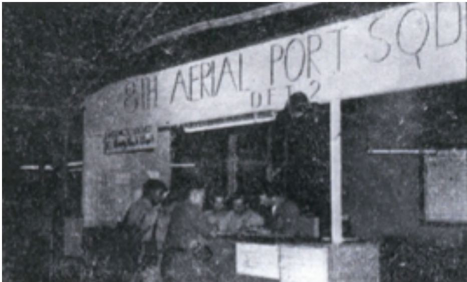
Det 2 at Da Nang

DEPARTMENT OF THE AIR FORCE UNIT HISTORIES