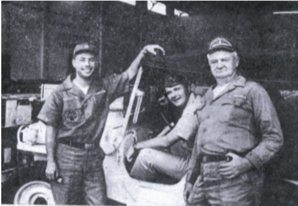
Det 6 Qui Nhon Det Can Tho